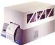
IDP Smart 70