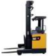
Linde H 20 T Forklift