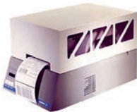
IDP Smart 70