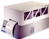
IDP Smart 70