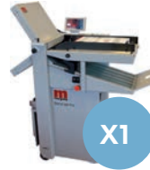
Morgana Major Folder