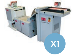
Morgana Documaster Pro Booklet Maker