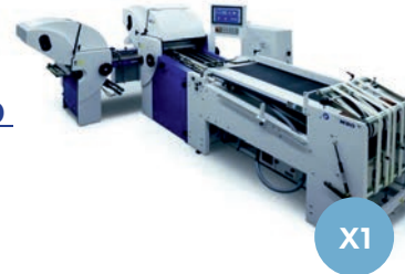
MBO T50/4-R50 Folder with high folding precision