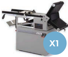
Morgana UFO1 Folder