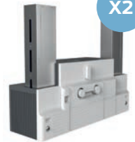
IDP Smart 70