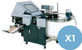
Horizon AFC-492 Cross Folder