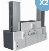
IDP Smart 70