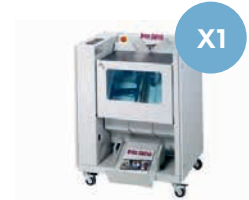
Mosca Inline Cross Strappers